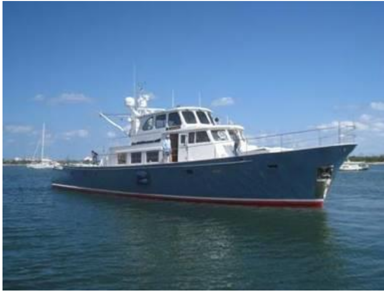
The M/V Makai