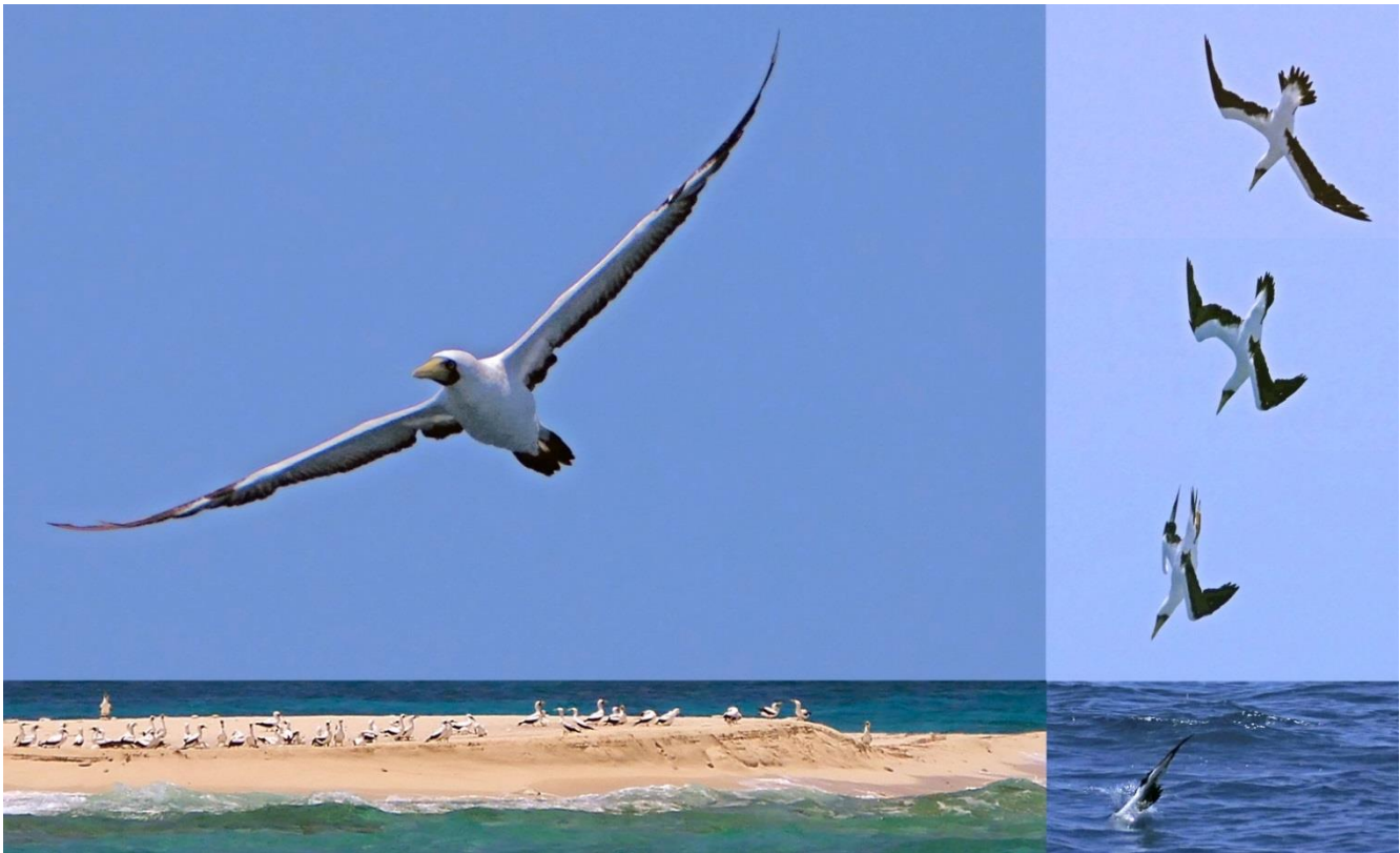
Masked Boobies nest on Hospital Key. It is their sole breeding colony in the U.S.

the birds we want to see. We can expect a late morning or early afternoon arrival to the archipelago. Before anchoring, we'll be sure to include a stop by tiny Hospital Key, the only site in the U. S. where Masked Boobies nest.