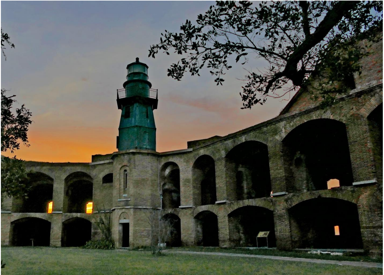
Sunrise within Fort Jefferson's Parade Grounds on Garden Key

The Tortugas are also a great place to see rarities. Highlights of previous trips have included White-tailed Tropicbird, Red-footed Booby, Black Noddy, LaSagra's Flycatcher, "West Indian" Cave Swallow, Bahama Mockingbird, Bananaquit and Shiny Cowbird.