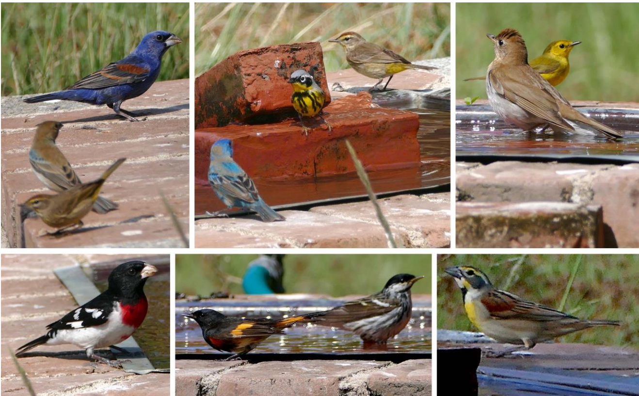
Many bird species including warblers, thrushes, buntings, and others visit the fountain regularly

Today, Fort Jefferson’s massive walls provide refuge not to armies of men, but to hundreds of exhausted trans-Gulf migrants. Its shores are visited not by conquering armies from foreign lands, but by birders, naturalists, fishermen, and curious visitors. The trees within its grounds are sometimes teeming with songbirds. As many as twenty species of warblers may feed among the foliage, while mute Cattle Egrets stalk scarce prey below.