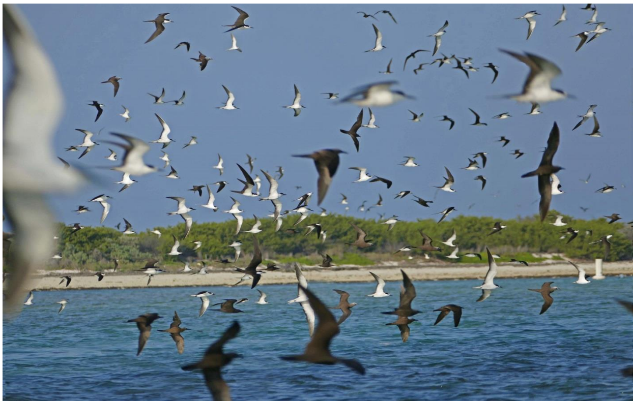
Sooty Terns and Brown Noddies streaming out of the colony at Bush Key

Next to Garden Key is the huge Sooty Tern colony on Bush Key. At first light, the colony is raucous, as thousands of birds become active. Along with Sooty Terns are a few thousand Brown Noddies and numbers of Brown Pelicans. The spectacle is simply awesome, as terns and noddies come and go endlessly, and we should be able to locate some recent hatchlings. Bush Key is the only nesting site in the United States for these two species.